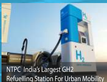
NTPC India's Largest GH2 Refuelling Station For Urban Mobility