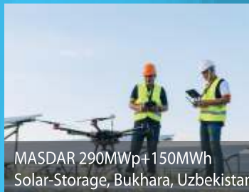
MASDAR 290MWp+150MWh Solar-Storage, Bukhara, Uzbekistan