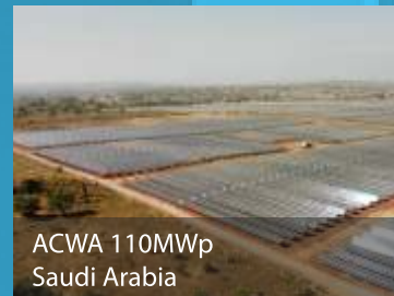
ACWA 110MWp Saudi Arabia