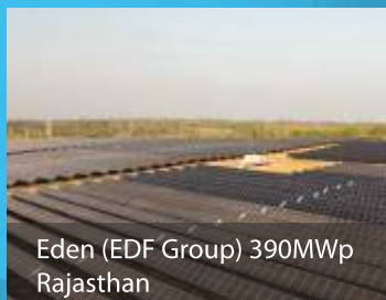
Eden (EDF Group) 390MWp Rajasthan