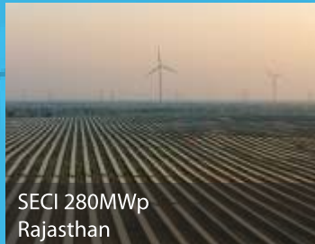
SECI 280MWp Rajasthan