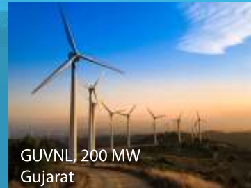
GUVNL 200 MW Gujarat