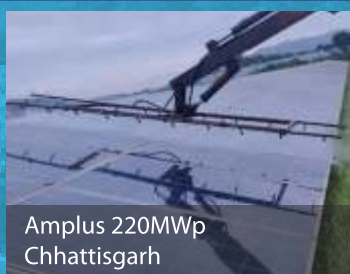
Amplus 220MWp Chhattisgarh