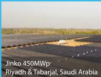
Jinko 450MWp Riyadh & Tabarjal, Saudi Arabia