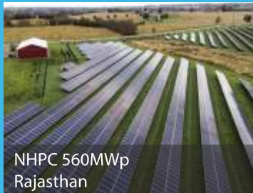
NHPC 560MWp Rajasthan