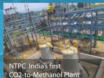
NTPC India's first CO2-to-Methanol Plant