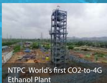
NTPC World's first CO2-to-4G Ethanol Plant