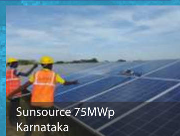
Sunsource 75MWp Karnataka